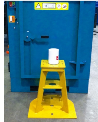
Insert for crushing oil filters