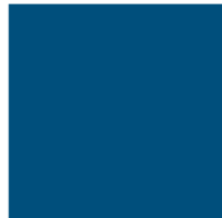
Standard-RAL machine colours without extra charge