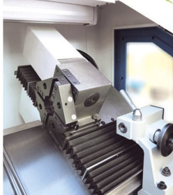
4-fold tool turret and tailstock