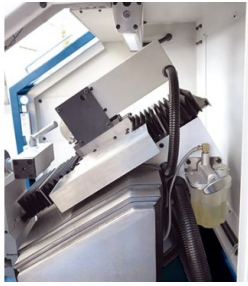
Slant bed machine frame